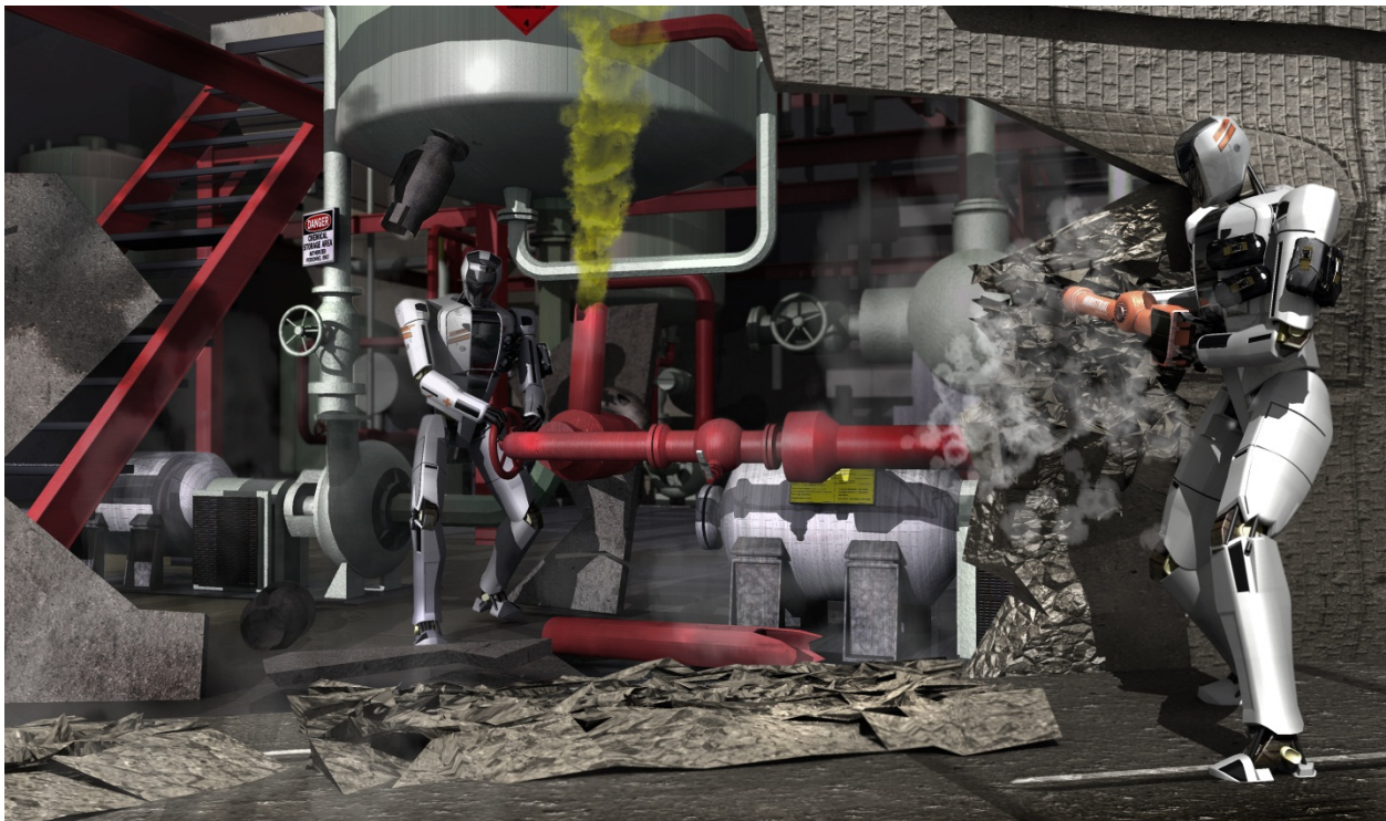
Figure 1. Illustration of example disaster response scenario.

Figure 1 illustrates Event 6 (the robot on the right-hand side using a power tool) and Event 7 (the robot on the left-hand side turning a valve). The form of these robots is for illustration only; while the robot must be compatible with human operators, environments and tools, there is not a requirement that it have a humanoid form.